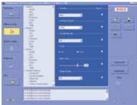
Offline set up screen of the Dinion XF cameras. Default shutter is set to 1/500 sec. A typical setting for traffic surveillance.