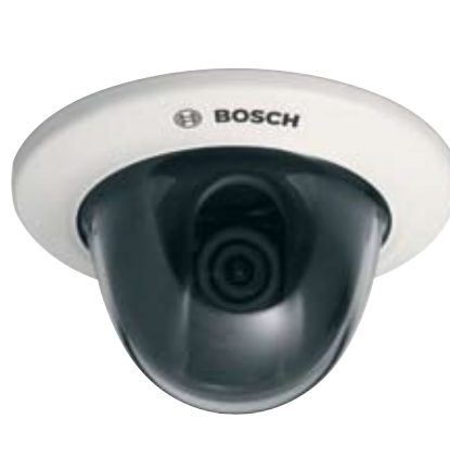
Bosch FlexiDomeXT+ is designed to produce high quality video under difficult lighting conditions as well as in the harshest environments.