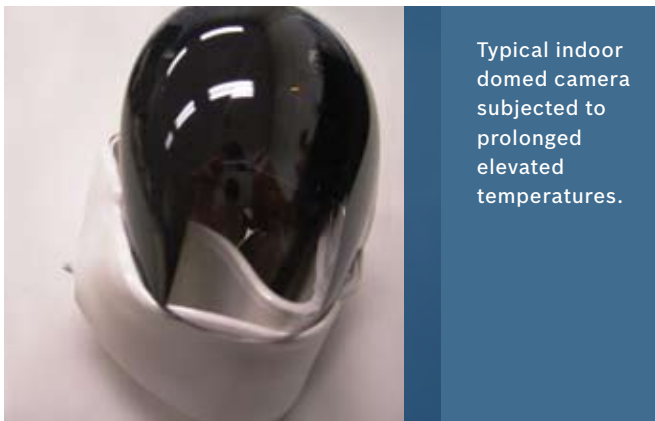
Typical indoor domed camera subjected to prolonged elevated temperatures.

But how can you judge the protection afforded to any camera? Luckily, there are standard impact tests, just as there are for dust and water resistance. The IEC 60068-2-75 makes it simple to ascertain a product’s protection level.